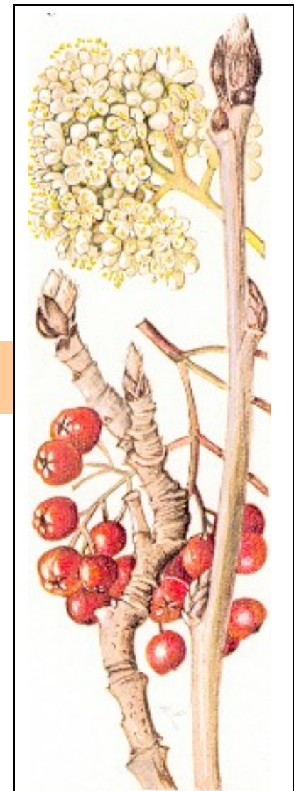
Rowan, ( Sorbus aucuparia )